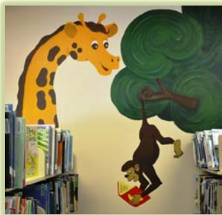
CHS Art Work in the Christiansburg Library