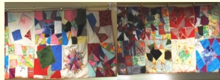
Crazy Quilt Squares at the Meadowbrook Public Library