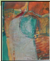
Art Wall Blacksburg Library